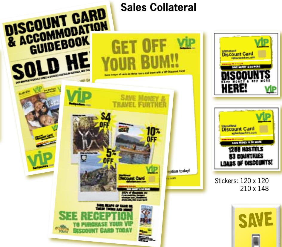
Stickers: 120 x 120 210 x 148